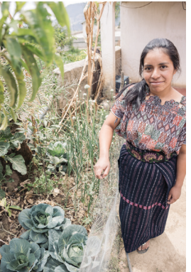
An Agronomist and technicians support the sustainable cultivation of the fields.